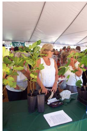
Fig trees are available for purchase at Fig Fest.