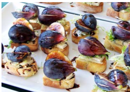
Campagna's Fresh figs with Cambazola Cheese on Crostini drizzled with balsamic syrup.

We live in a rich agricultural region. The goal of Slow Food Madera is to promote the uniqueness and quality of food and wine made in Fresno and Madera Counties - and have fun doing so! We are succeeding on both counts. Slow Food Madera has made some valuable contributions to our social, cultural & economic life and we plan to make more! A vibrant food and wine scene and increasing appreciation for the food and wine produced here will benefit everyone. We want and need your participation in this wonderful vision. We encourage you to step out of the fast lane by enjoying and by joining Slow Food Madera. www.slowfoodmadera.org